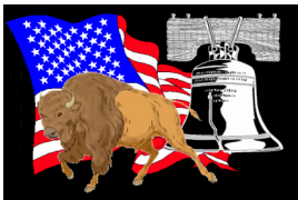
The Independent Word

No guarantee of publication is made. Editors and writers collaborate closely on revisions, which can be extensive, and final copy is sent to authors for approval.